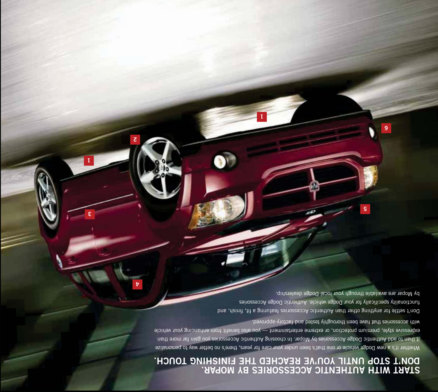
SHOWN ON COVER: 17-INCH CHROME-PLATED ALUMINUM WHEEL, CHROME BODYSIDE MOLDINGS AND DECAL KIT ADD A CUSTOM TOUCH.

Whether it's a new Dodge vehicle or one that's been under your care for years, there's no better way to personalize it than to add Authentic Dodge Accessories by Mopar. In choosing Authentic Accessories you gain far more than expressive style, premium protection, or extreme entertainment — you also benefit from enhancing your vehicle with accessories that have been thoroughly tested and factory-approved. Don't settle for anything other than Authentic Accessories featuring a fit, finish, and functionality specifically for your Dodge vehicle. Authentic Dodge Accessories by Mopar are available through your local Dodge dealership.